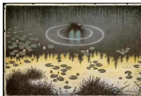
Theodor Kittelsen Nøkken 1904

About 35% improved but still in need of special care